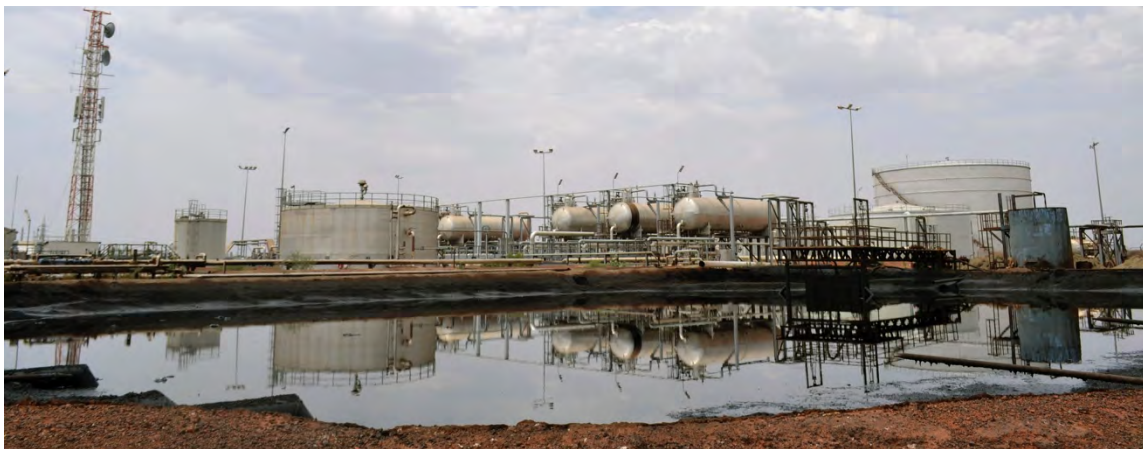
Oil represents a key prize for South Sudanese politicians. Whoever controls this resource has key leverage over political rivals. Photo: Unity oil fields. May 2012.

The 2005 Comprehensive Peace Agreement gave the south control over half of the revenues from oil pumped in southern territory, 67 but Khartoum’s management of the oil industry was opaque, raising concerns about whether the south was receiving its half of the revenues. 68 Significant issues about oil revenues and border areas—including those with oil, like Abyei—remained unresolved and contentious to the point of violence even after South Sudan’s independence. Nevertheless, in 2011, the new SPLM/A-led South Sudanese government gained control of 70 to 75 percent of the oil fields. 69 (Approximately 80 percent of