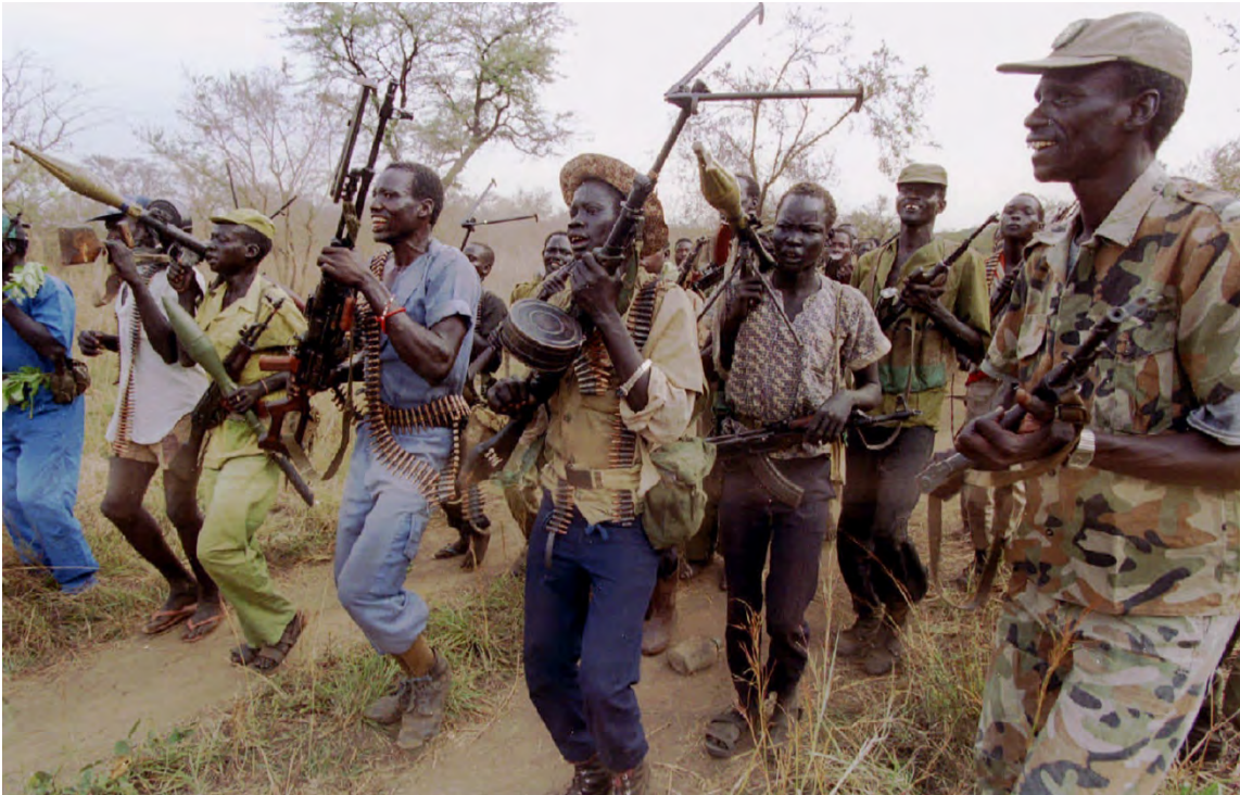
SPLA soldiers dance during the Sudanese Civil War. During the war, which lasted from 1983 to 2005, predatory practices began to emerge in the SPLA.

varying alliances with one another. They were both predatory and protective toward local populations, 10 fighting against one another at certain times 11 and forming alliances at others. 12 The Sudan People's Liberation Army (SPLA) 13 is the dominant group that emerged from this struggle and currently holds power; its political wing is the SPLM.