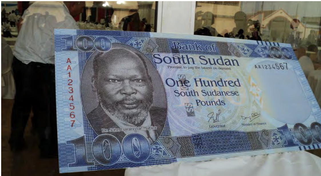
Enlarged new banknotes on display during South Sudan's independence celebrations. July 2011.