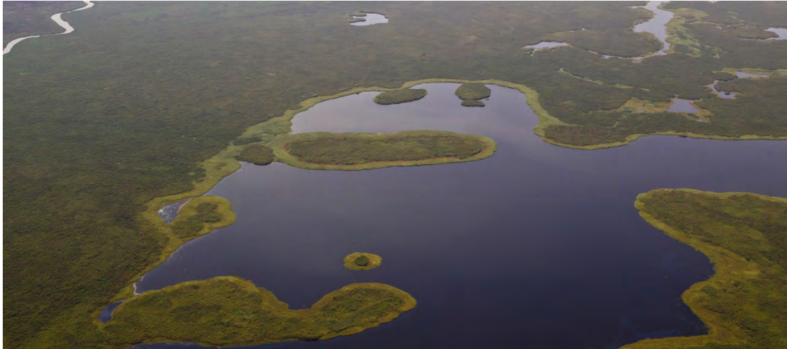
The Sudd waterways illustrate the richness of South Sudan's natural resources, which include oil, arable farmland, water, timber, and precious minerals.

South Sudan imports almost all consumer goods and has a cash-based subsistence economy. Beyond the oil sector, most livelihoods are in unpaid subsistence agriculture and pastoralism, which account for 15 percent of the GDP. 53 Most of the population—approximately 85 percent—performs non-wage work, and approximately 78 percent of the population is involved in farming. 54 Having declared a famine in February 2017, 55 the U.N. estimates almost five million people in South Sudan face severe food insecurity and urgently need international assistance. 56