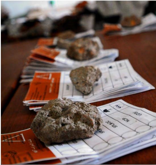
In Bentiu, Southern Sudan, ballots are sorted for counting for the 2010 general election.

positions, and the line between the party and the military was blurred or nonexistent.