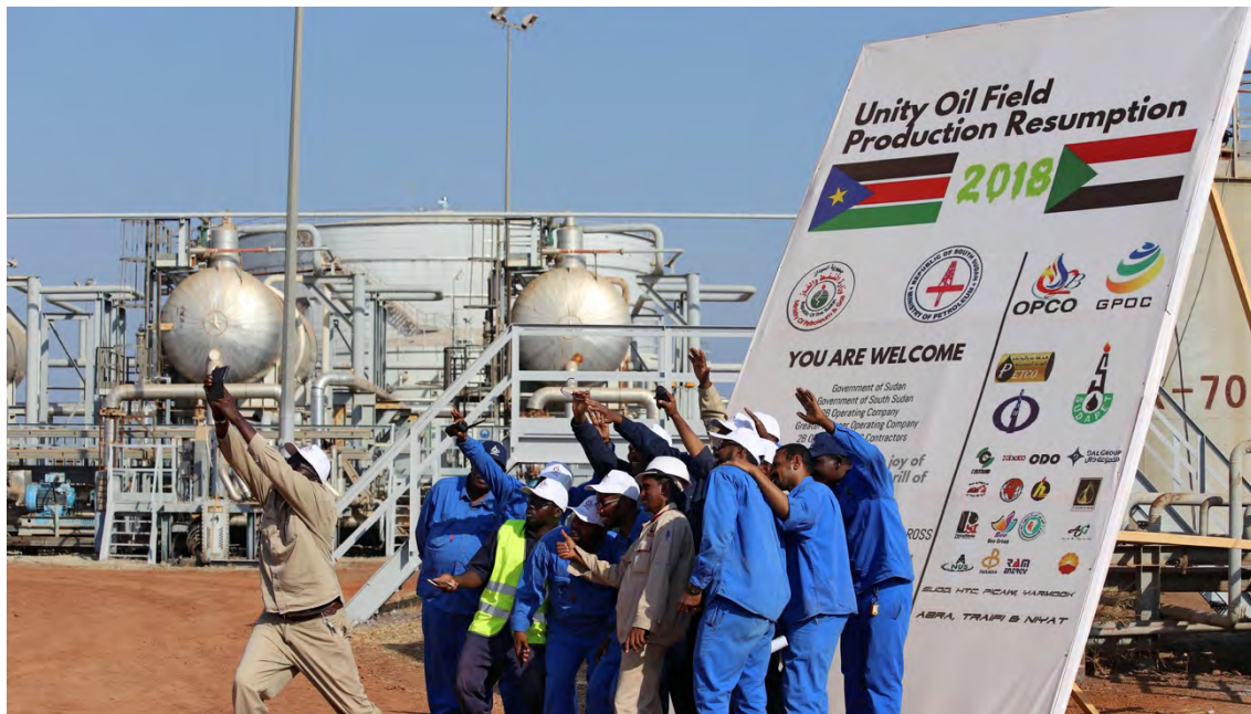
In January 2019, oil production resumed at wells in the Unity oil fields that were shut down by fighting between government and rebel troops in 2014.

Violence has erupted, become deadlier, spread to involve more people, and become more commercialized as a result of the way oil revenues have been spent. Misappropriation of